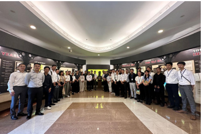
TATA - Industry Visits